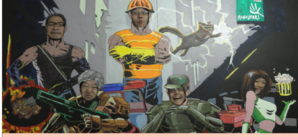
Baishizhou Superhero (2014) installation by Liu Wei

heals and shiny sandals, and all expect—and are expected—to keep their feet clean and dry.