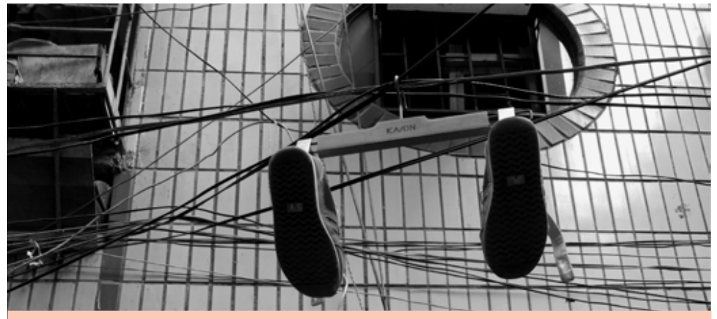
Trainers (2017) photography by Zheng Kuai, Handshake 302 artist-in-residence, October 2017

The official Baishizhou footprint occupies roughly 0.73 square kilometres. Overseas Chinese Town (OCT) abuts its northern, southern, and eastern borders, and the Shahe Golf Club lies next to its western edge. Internally, vernacular Baishizhou comprises six sections that point to the neighbourhood's history-the Shahe Industrial Park and the five villages-Baishizhou, Shangbaishi, Xiabaishi, Xintang, and Tangtou. Their administrative integration is an artefact of collectivisation. In 1959, the villages were designated Shahe Farm, a provinciallevel outpost of the Guangming Overseas Chinese Dairy in northern Shenzhen. Four